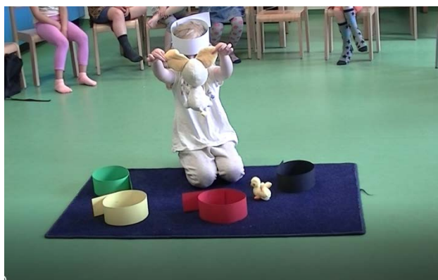
Figure 1: Pupil discussing familiar cuddly toys (2016)